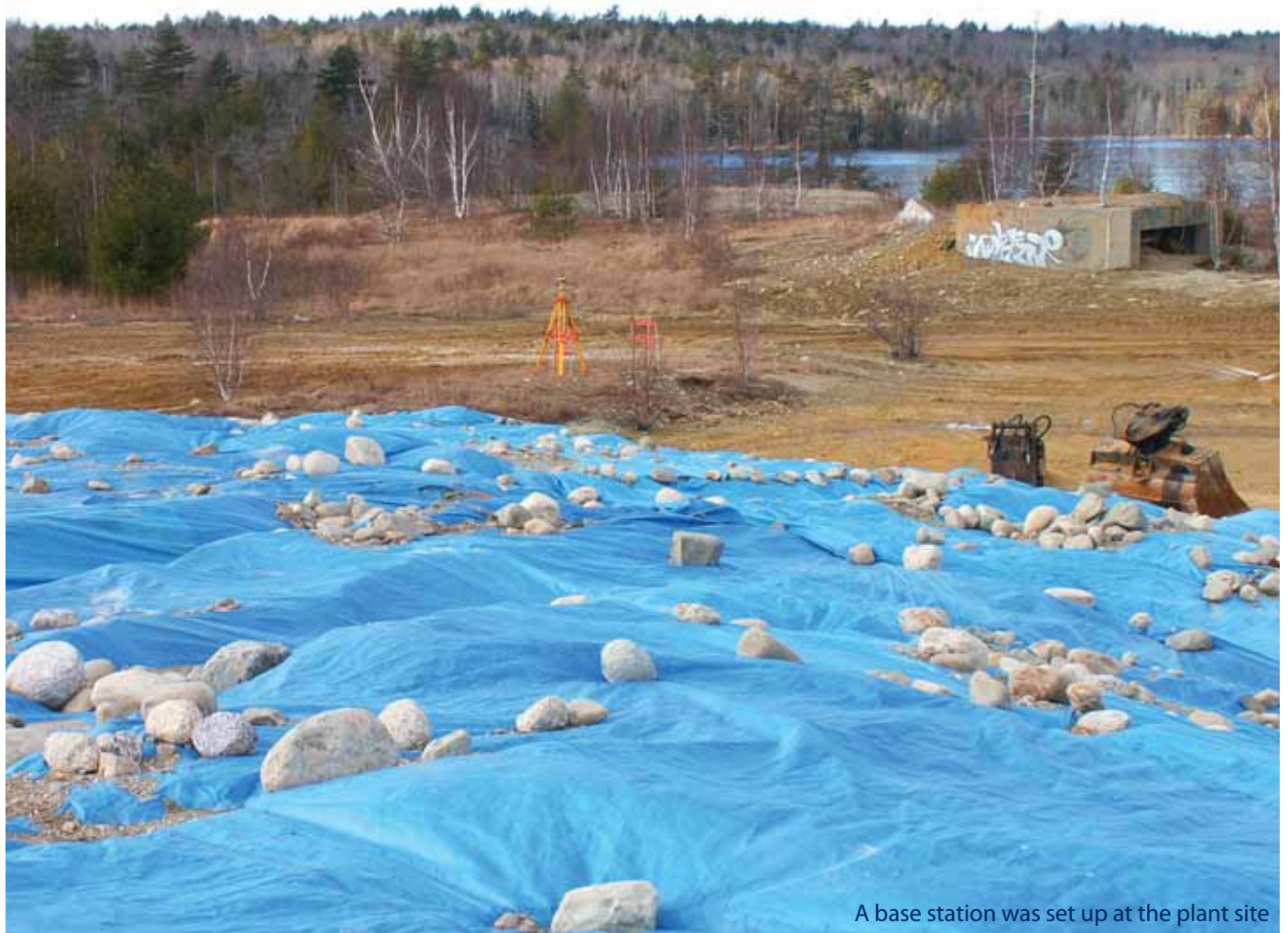
A base station was set up at the plant site